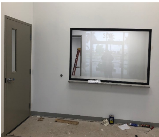
View of Reception Area